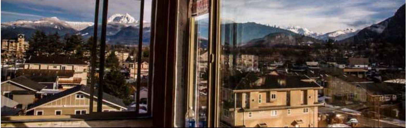
The view from one of the one-bedroom apartments. (Photo taken during construction)

These new one-bedroom apartments are full of light and are the perfect size for downtown living.